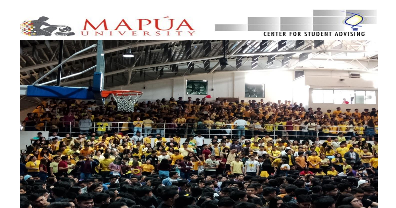
Invocation & National Anthemby MAPÚA CARDINAL SINGERS