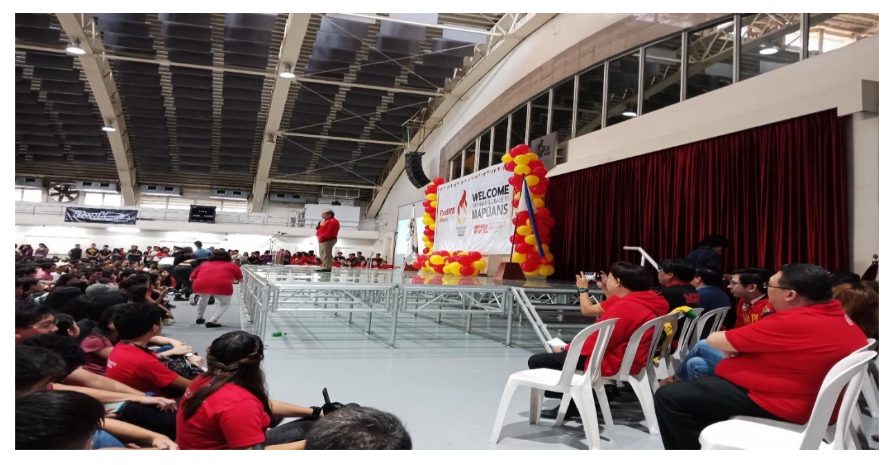
Introduction of MAPÚA Administrators