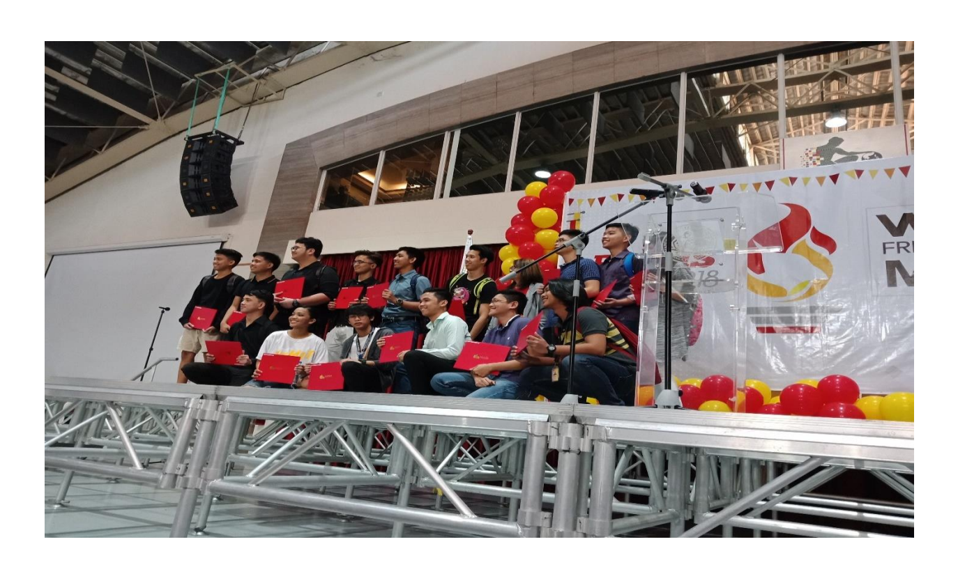
Testimonial of Board Top-notcher by